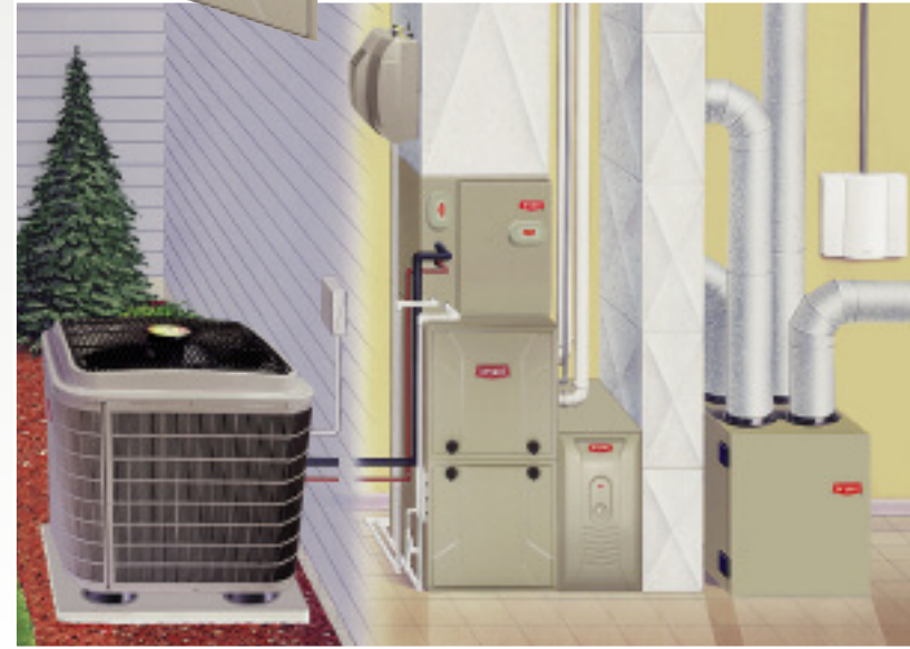
HYBRID HEAT® Dual Fuel Heat Pump and Gas Furnace System