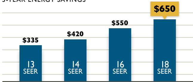
Savings versus 10.00 SEER units

The Armstrong Air™ 4SCU18LS air conditioner. Chosen with confidence by people who expect and deliver excellence.